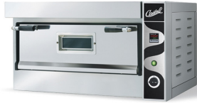
Caldo Single Wide Deck Warming Oven SPB/3