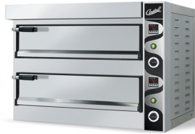
Caldo Double Deck Warming Oven SP/2C