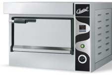
Caldo Single Short Deck Warming Oven SPB/1